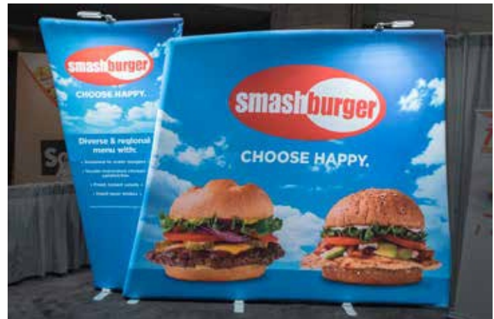
LED Lights and Stabilizer Foot

WindScape units stand alone or integrate with other Skyline portable and modular systems.